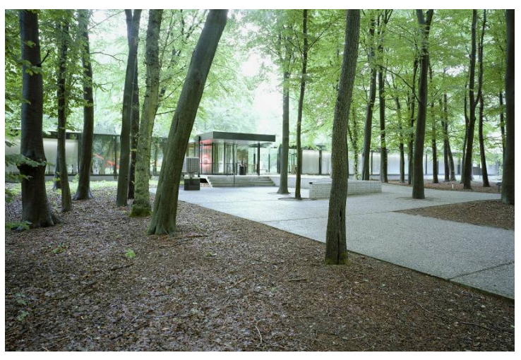
Kröller-Müller Museum entrance.

Please note: The Kröller-Müller Museum is situated in the National Park De Hoge Veluwe. Transport from your hotel in Otterlo or Hoenderloo to the museum will take some time and planning.